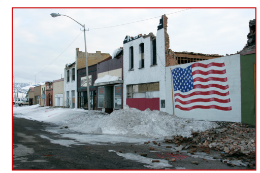
San Marin Hotel following the 2008 M 6.0 Wells, Nevada earthquake