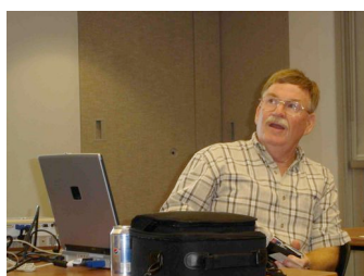
Woody's interactive presentation showed how the use aerial photos can be enhanced using GIS software.