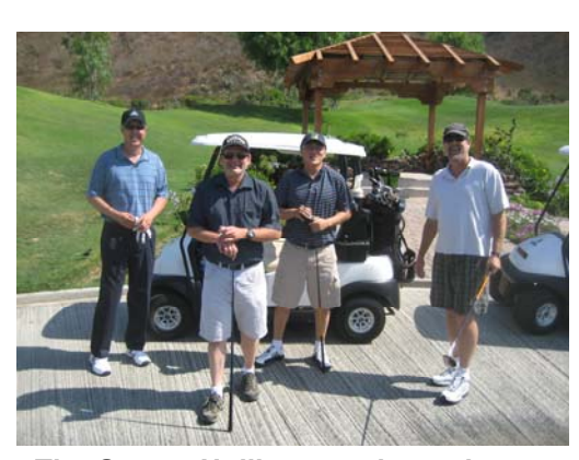
The Grover-Hollingsworth contingent